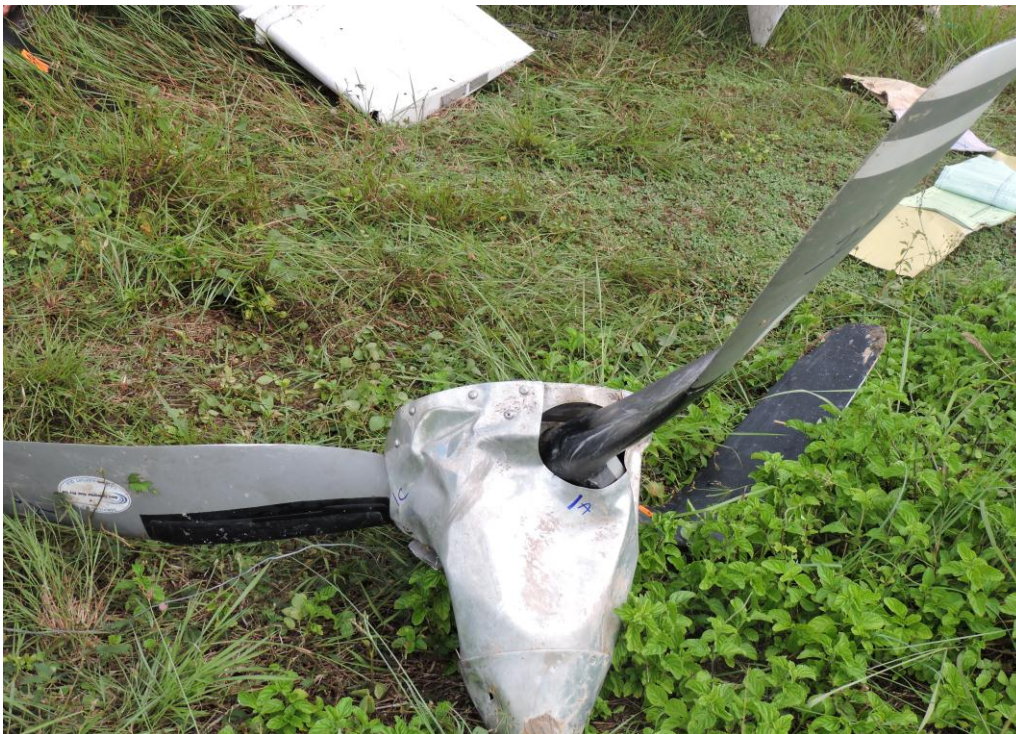
Figure 6: Left hand propeller after removal from accident site

The propellers are shown after their removal from the accident site in Figures 6 and 7.