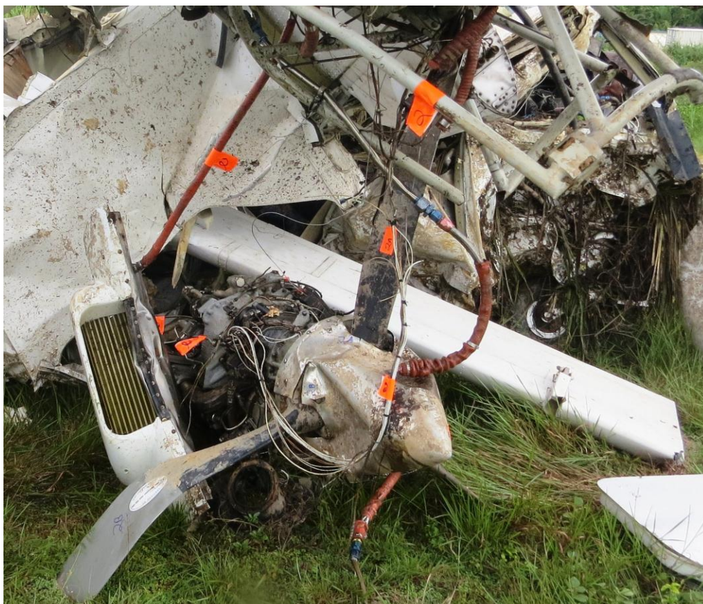
Figure 7: Right hand propeller (feathered) after removal from accident site

The flaps were in the fully-extended position (see Figure 3).