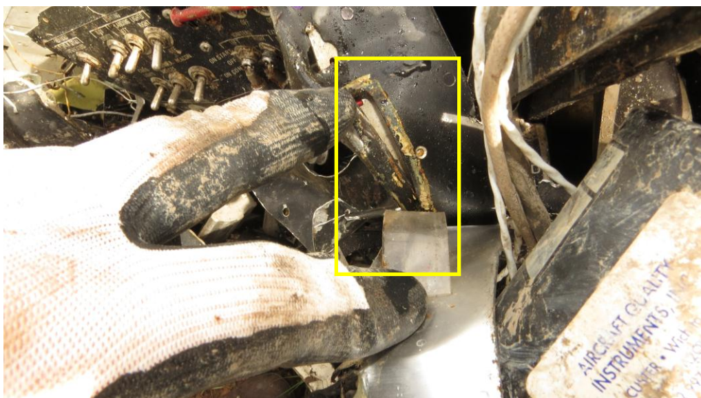
Figure 8: Elevator trim indicator (in yellow box)

The elevator trim tab was in the full nose-down position. The elevator trim indicator in the cockpit had been crushed in place; it indicated full nose-down (Figure 8).