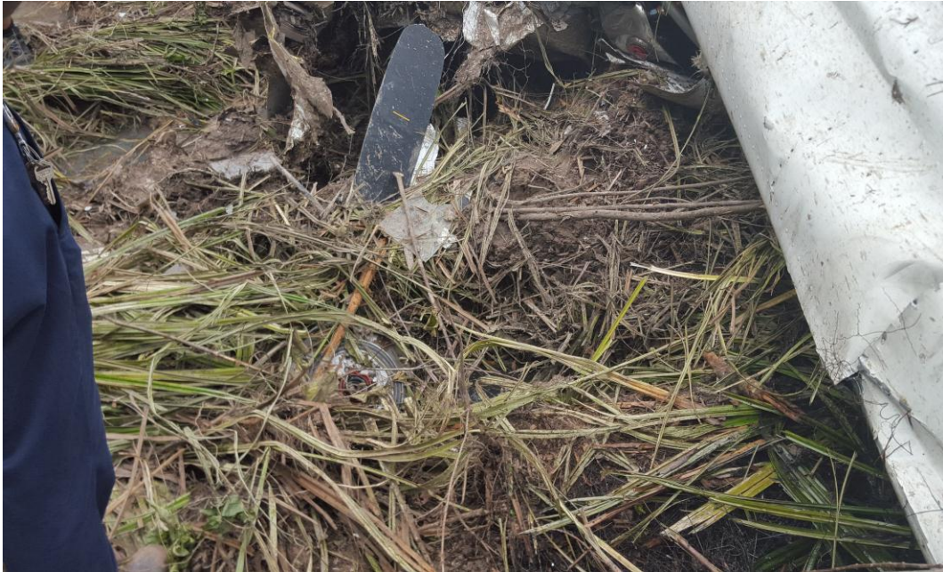
Figure 4: Left hand propeller at accident site

which broke the propeller shaft; it was not feathered. The right hand propeller (Figures 5 and 7) was still attached to the engine and was in the feathered position.