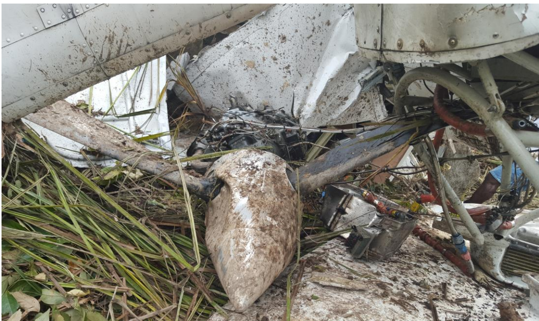
Figure 5: Right hand propeller (feathered) at accident site; note one blade buried in mud