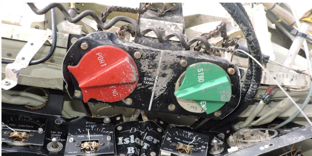
Figure 10: Fuel selectors

Both cockpit fuel selectors were found in the positions shown in Figure 10.