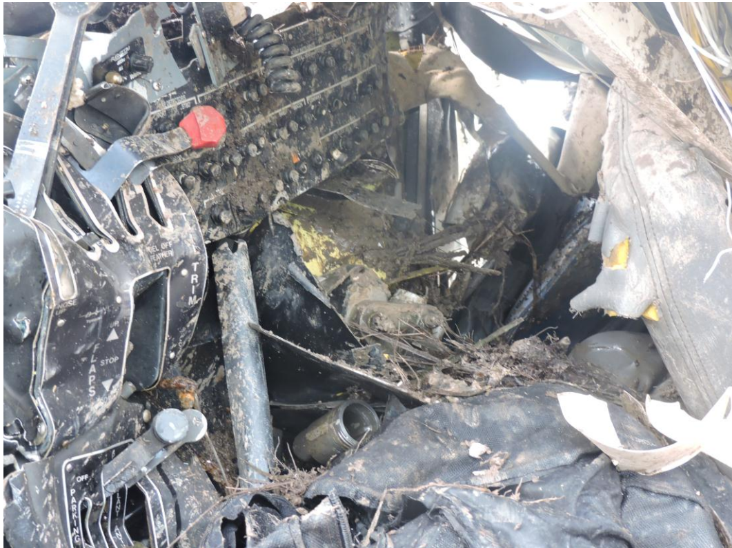
Figure 9: Power levers and condition levers

Both cockpit fuel selectors were found in the positions shown in Figure 10.