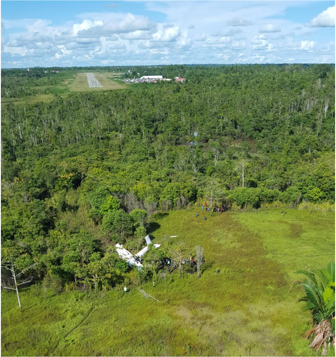
Figure 2: Accident site and wreckage looking in an easterly direction (taken 90 minutes after the accident)