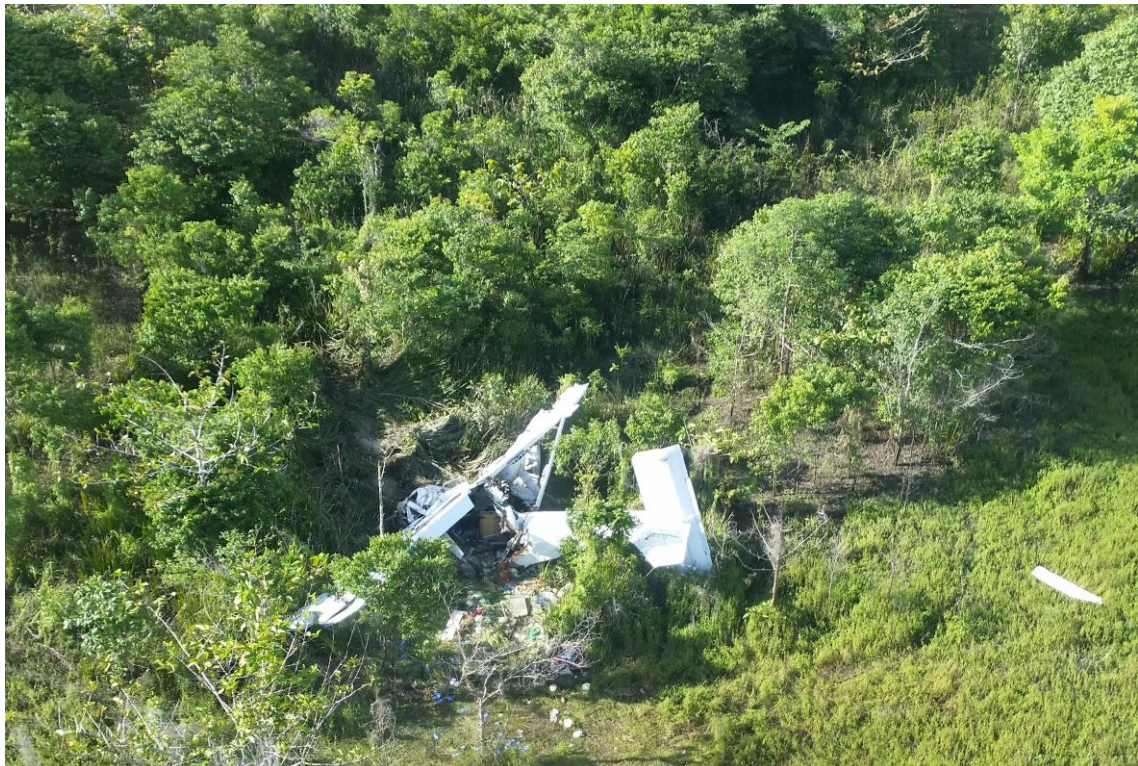
Figure 3: Wreckage of SBC

The aircraft was destroyed in the accident (Figure 3).