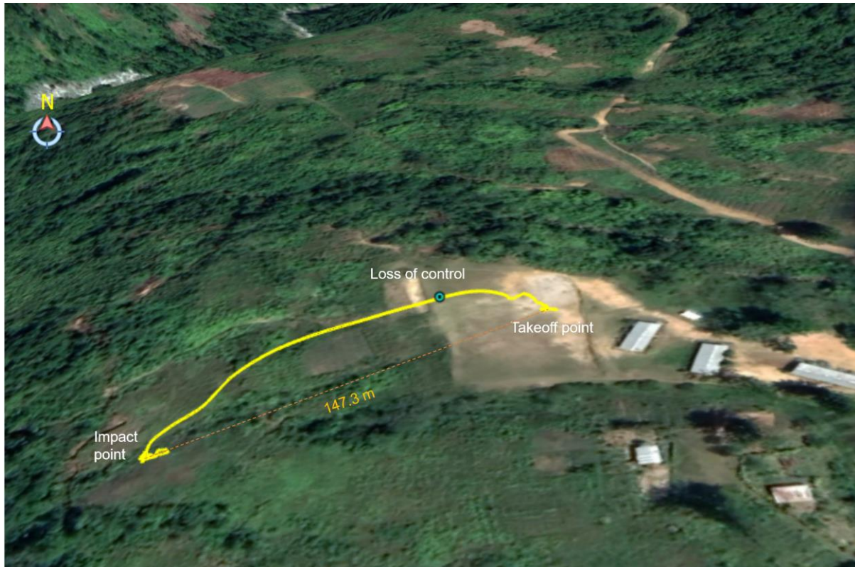
Figure 1: Depiction of P2-MHM flight path from Gobo to the crash site.

On 15 May 2021, at 11:14:06 local time (01:14:06 UTC 1 ), a MIL-8 MTV helicopter, registered P2-MHM, owned by Captston Aviation PTE 2 Limited and operated by Hevlift Aviation Limited, while conducting a VFR charter cargo flight from Gobo, Jiwaka Province to Mt. Hagen, Western Highlands Province, sustained a loss of control in-flight, during take-off from hover and impacted ground and rolled over.