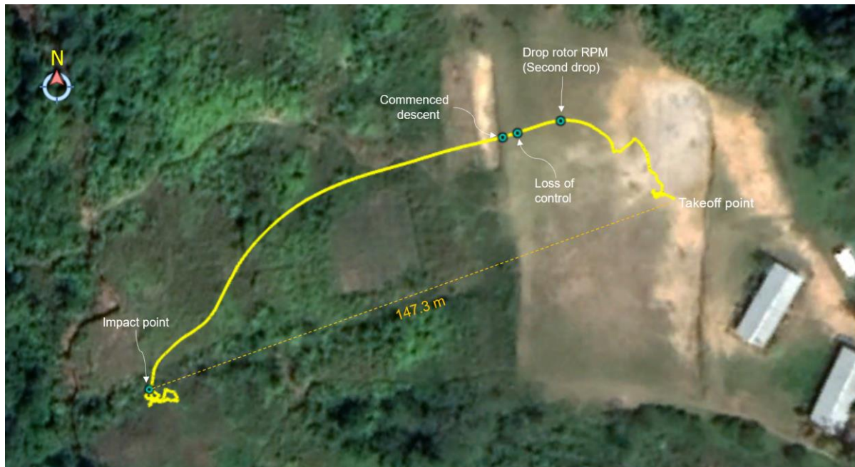
Figure 2: Depiction of the flight path from Gobo with significant events.