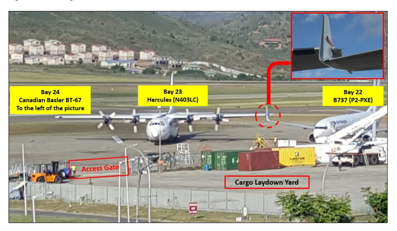
Figure 2: Wings collision damage (Source: Eye witness)

Marshalling guidance was provided at Bay 23 by the Operator's ground personnel. At 05:15, as the Hercules PIC was manoeuvring the aircraft slightly to the left to prepare the aircraft to make a right turn and position its aft end to face the airport access gate to the cargo yard, the radius of turn took it past the wing tip of the Boeing 737. The Boeing 737 was stationary and unoccupied on the apron. The leading edge of the left wing of the Hercules impacted the right winglet of the Boeing 737 causing significant damage to both aircraft.