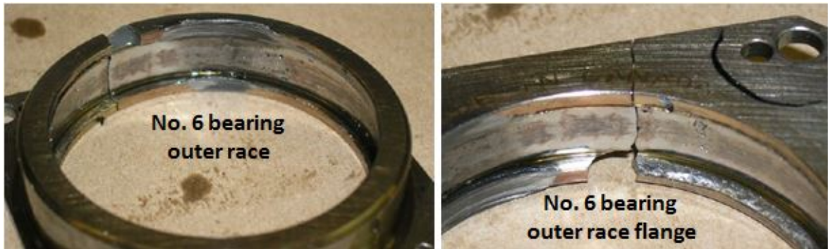
Figure 3: No 6 bearing outer race

The manufacturer concluded that the engine No. 1 power section lost useful power due to the disintegration of the combining gearbox left hand 1 st stage gear input shaft roller bearing (No. 6 Bearing), which allowed radial movement and vibration of the left hand 1 st stage gear and disengagement with its mating idler gear. This unloaded the No. 1 Power section power turbine drive train, allowing the power turbine to accelerate to an overspeed condition and release the power turbine blades, with resultant damage to the adjacent and drive train components. One No. 6 bearing outer race retaining bolt locking key washer was not in place, which resulted in loosening of the bolt with subsequent vibration and eccentric loading leading to fracture of the inner race and liberation of the rolling elements. The No. 6 bearing is accessed only at overhaul or major repair. The facility conducting the last overhaul of the combining gearbox could not be determined from records forwarded with the engine.