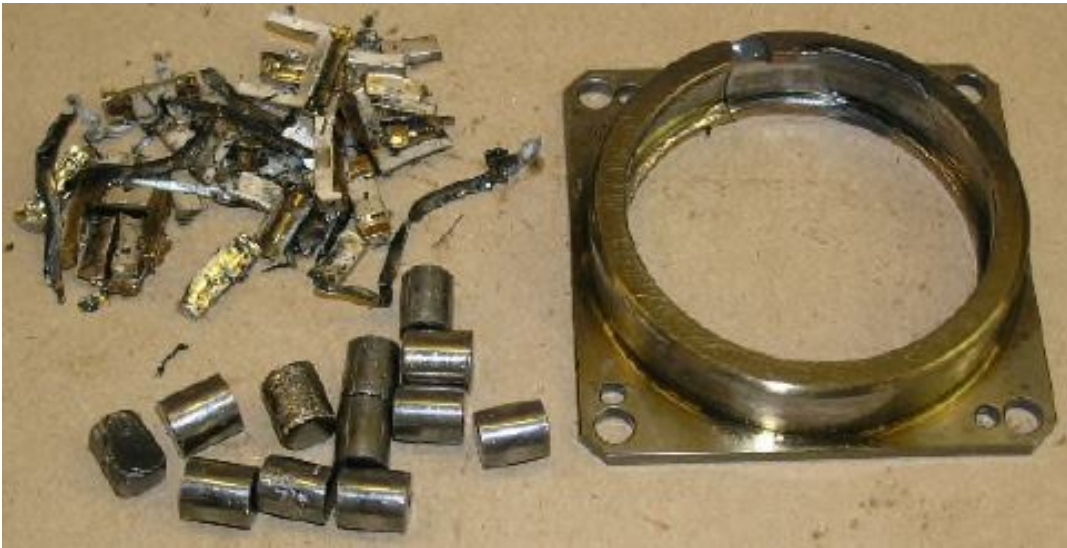
Figure 4: No. 6 bearing showing failed components