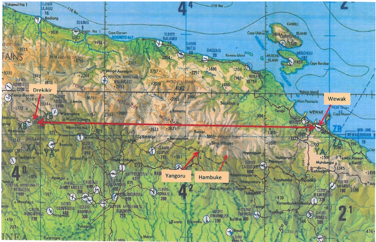
Figure 1: Map of the area of the flight

On 30 May 2014, a Agusta Bell B212 helicopter, registered P2-IHP, owned and operated by Island Hoppers Limited was being operated on a commercial flight to transport government officials to the Dreikir and Yangoru areas. There were 14 persons on board; one pilot and 13 passengers.