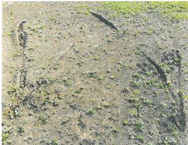
Figure 2: Heavy landing imprint made by landing gear skids

After the heavy landing all thirteen passengers evacuated the helicopter to a safe distance away and were rescued by another helicopter to continue their journey as planned. None of the occupants were injured.